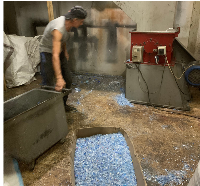
WASTE & CIRCULAR ECONOMY