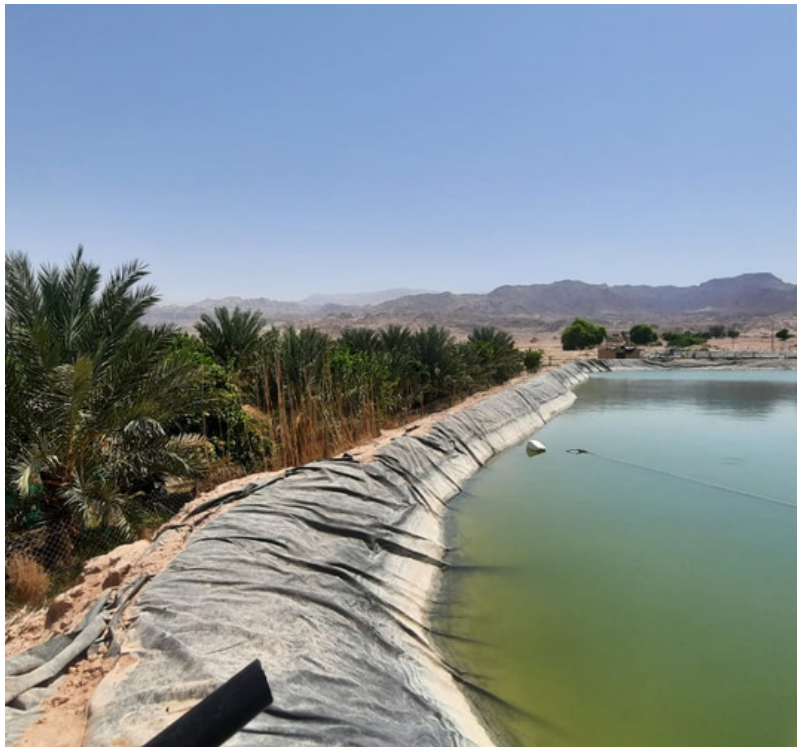
WATER & SANITATION