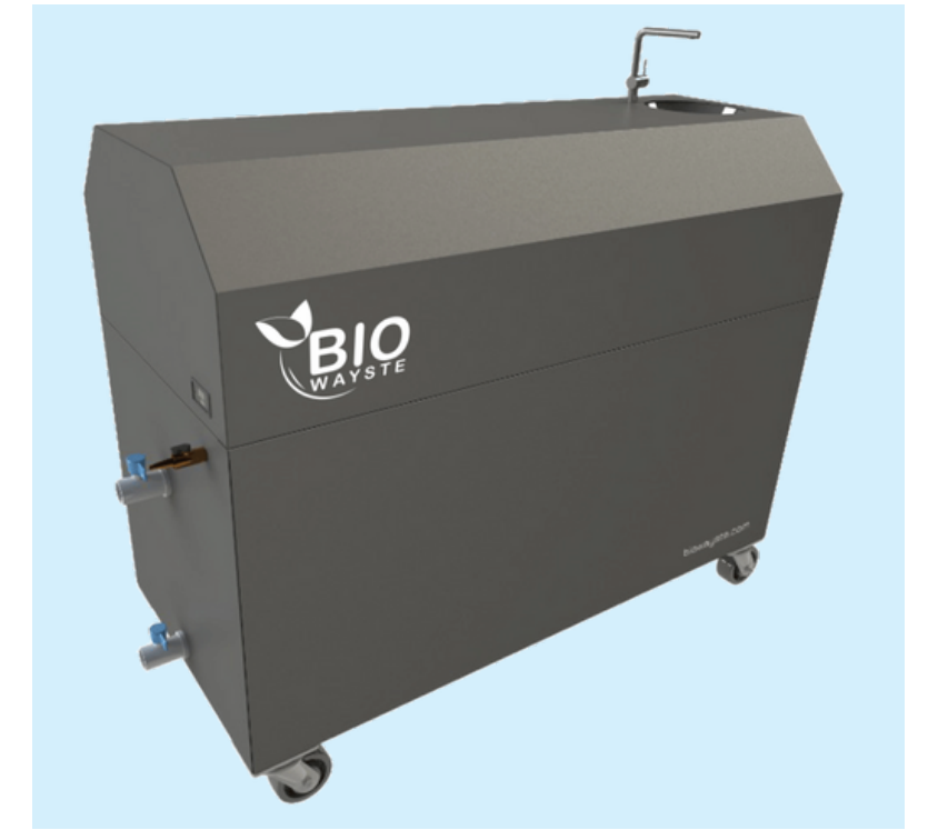
INNOVATIVE ENERGY & EFFICIENCY